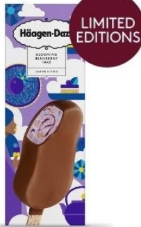
Blooming Blueberry Tart