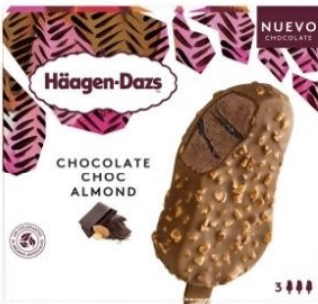
Chocolate Choc Almond (3x12Packs)