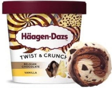
Twist & Crunch Belgian Chocolate & Vanilla