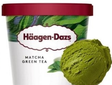
Matcha Green Tea