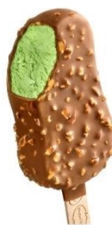
Matcha Green Tea & Almond