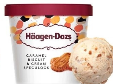
Caramel Biscuit & Cream