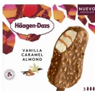
Vanilla Caramel Almond (3x12Packs)