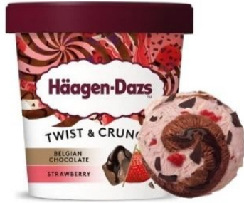
Twist & Crunch Belgian Chocolate & Strawberry