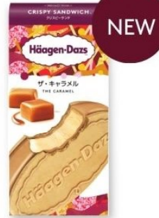
The Caramel Crisp Sandwich