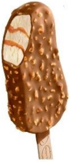
Vanilla Caramel Almond