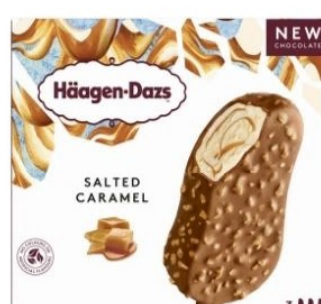
Salted Caramel (3x12Packs)