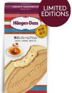
Crisp Crème Brûlée Crisp Sandwich