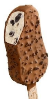
Cookies & Cream