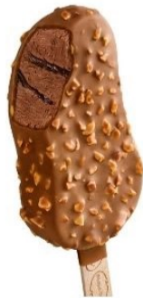
Chocolate Choc Almond