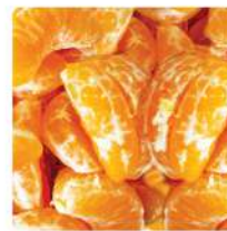
IQF Mandarin Orange

Product Code : FRR0246 Size/ Packing : 1 kg x 10 packs