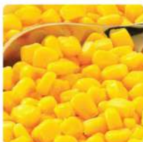
Frozen Kernel Corn Grade A

Product Code : VBR0005 Size/ Packing : 1 kg x 10 bags