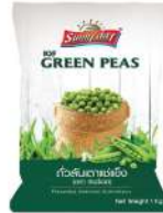
IQF Green Peas

Product Code : VBR0109 Size/ Packing : 10 kg x 10 bags