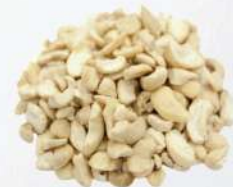
Broken Cashew Nut (Size L)

Size/Packing : 10 kg Product Code : NTN0077