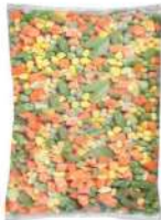
IQF Mix Vegetables (Carrot, Green Peas and Corn)

Product Code : VBR0100 Size/ Packing : 1 kg x 5 bags / 10 bags