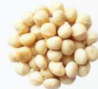
Whole Macadamia Nut

Size/Packing : 1kg Product Code : NTN0022