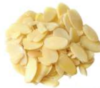
Sliced Almond 20/22

Size/Packing : 11.34 kg /1 kg x 2 Product Code : NTN0010 /0010R