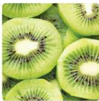
IQF Kiwi Slices

Product Code : VBR0191 Size/ Packing : 10 kg /box