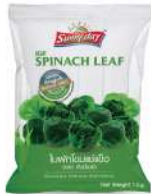
IQF Spinach Leaf Size 23-25 g. / pc

Product Code : VBR0109 Size/ Packing : 10 kg x 10 bags