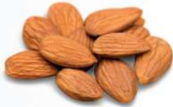
Whole Almond 20/22

VARIOUS CHOICES FOR YOUR HEALTH NUTRITIOUS EVERY HANDFUL