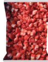
IQF Strawberry Dice Sweet Charlie

Product Code : VBR0191 Size/ Packing : 1 kg x 10 bags