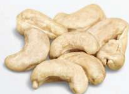
Whole Cashew Nut (Grade A)

Size/Packing : 1kg Product Code : NTN0002