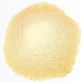
Fine Diced Almond

Size/Packing : 11.34 kg /1 kg x 2 Product Code : NTA0036/0366R