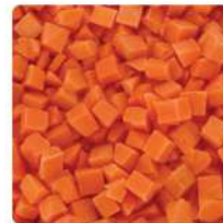
IQF Diced Carrot

Product Code : VBR0009 Size/ Packing : 1 kg x 10 bags