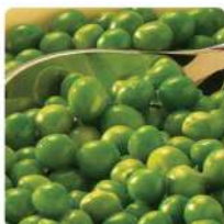
Green Soy Bean Kernel

Product Code : FRR0244 Size/ Packing : 1 kg x 10 packs