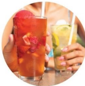
Häagen-Dazs with Beverages · Smoothies · Cocktail