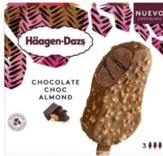
Chocolate Choc Almond (3x12Packs)