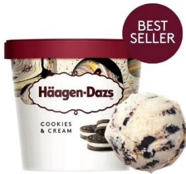
Cookies & Cream