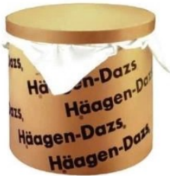
2.5 Gallon Bulk Unit/Case:

96 Scoops · Around 3 oz per scoop 144 Scoops · Around 2 oz per scoop