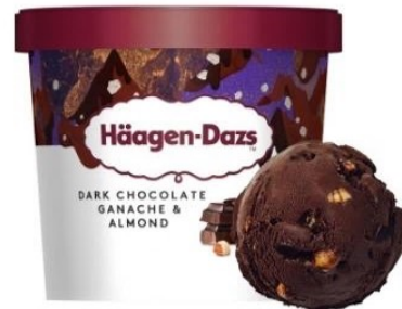
Dark Chocolate Ganache & Almond