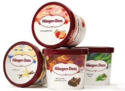
Häagen-Dazs Mini Cup 100ml x 24

96 Scoops · Around 3 oz per scoop 144 Scoops · Around 2 oz per scoop