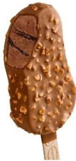
Chocolate Choc Almond