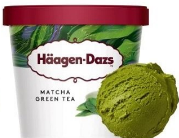
Matcha Green Tea