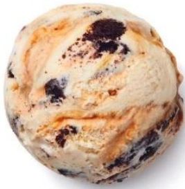
Vanilla Caramel Brownie