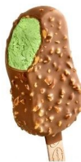
Matcha Green Tea & Almond