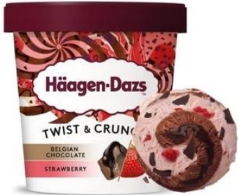
Twist & Crunch Belgian Chocolate & Strawberry