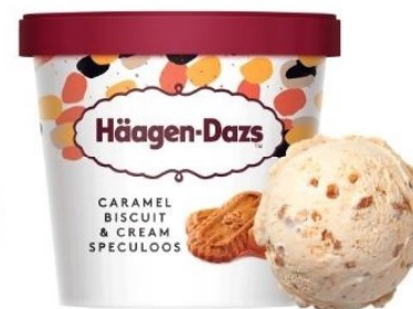
Caramel Biscuit & Cream