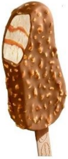
Vanilla Caramel Almond