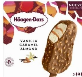
Vanilla Caramel Almond (3x12Packs)