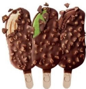
Häagen-Dazs Stick Bar 80ml x 12