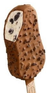
Cookies & Cream