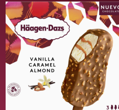
Chocolate Choc Almond (3x12Packs) Vanilla Caramel Almond (3x12Packs)