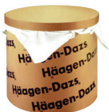
2.5 Gallon Bulk Unit/Case: 96 Scoops · Around 3 oz per scoop 144 Scoops · Around 2 oz per scoop