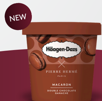
MACARON DOUBLE CHOCOLATE GANACHE