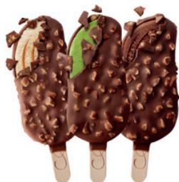
Häagen-Dazs Stick Bar 80ml x 12