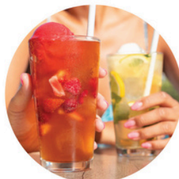
Häagen-Dazs with Beverages · Smoothies · Cocktail