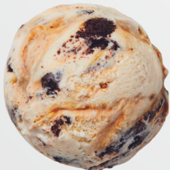
Vanilla Caramel Brownie