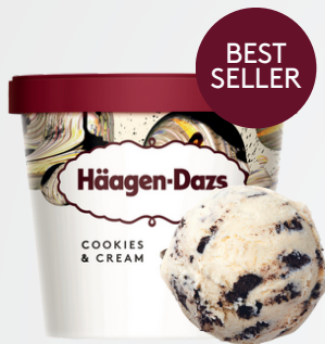
Cookies & Cream