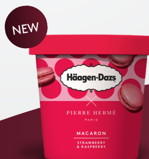
MACARON STRAWBERRY & RASPBERRY