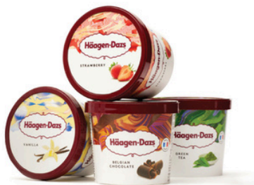
Häagen-Dazs Mini Cup 100ml x 24