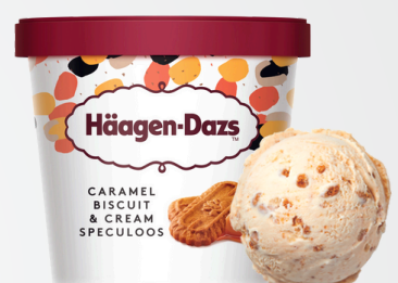
Caramel Biscuit & Cream