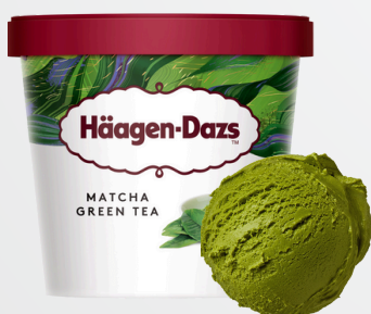
Matcha Green Tea