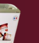
ตู้คอน 1.2 m.