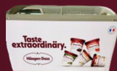
ตู้คอน 1 m.