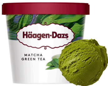
Matcha Green Tea