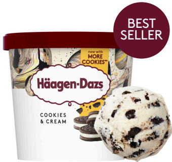
Cookies & Cream