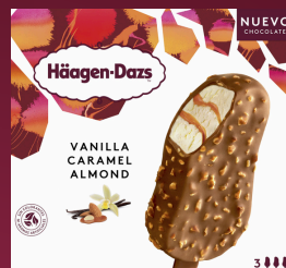
Vanilla Caramel Almond (3x12Packs)