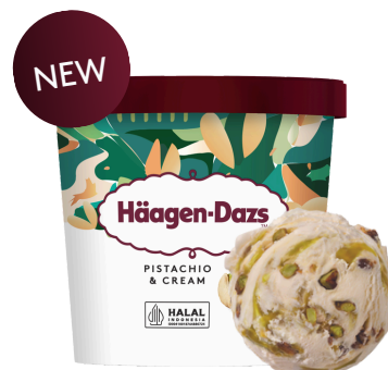
Pistachio & Cream