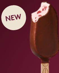
Strawberry & Cream