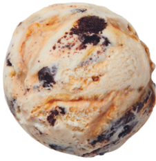
Vanilla Caramel Brownie