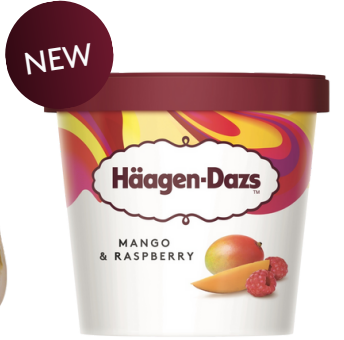
Mango & Raspberry