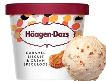
Caramel Biscuit & Cream