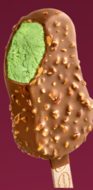
Matcha Green Tea & Almond