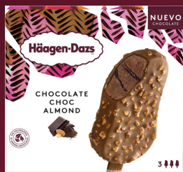
Chocolate Choc Almond (3x12Packs)