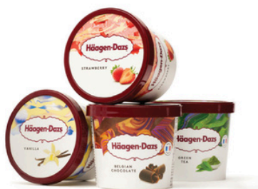
Häagen-Dazs Mini Cup 100ml x 24

96 Scoops · Around 3 oz per scoop 144 Scoops · Around 2 oz per scoop