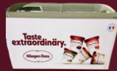
ตู้บ่อน 1 m.