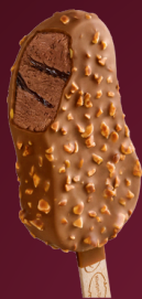
Chocolate Choc Almond